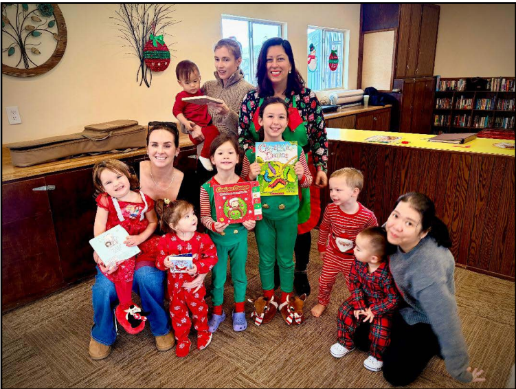
Play Group Celebrating the Holiday With a Pancakes & Pajama Party!