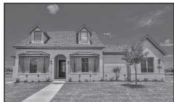
3815 128th St, Lubbock, Texas Just Sold for $710,000! 4 Bed | 4 Bath | 3,022 SQFT