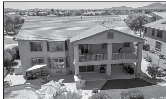
22103 N Cline Ct, Maricopa, Arizona Just Sold for $700,000! 5 Bed | 3 Bath | 3,954 SQFT