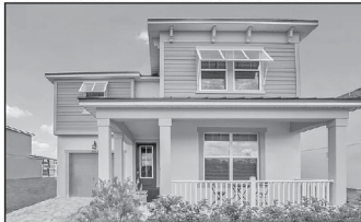
2059 Tropical Palms Cir, Kissimmee, Florida Just Sold for $700,000! 6 Bed | 5 Bath | 3,009 SQFT